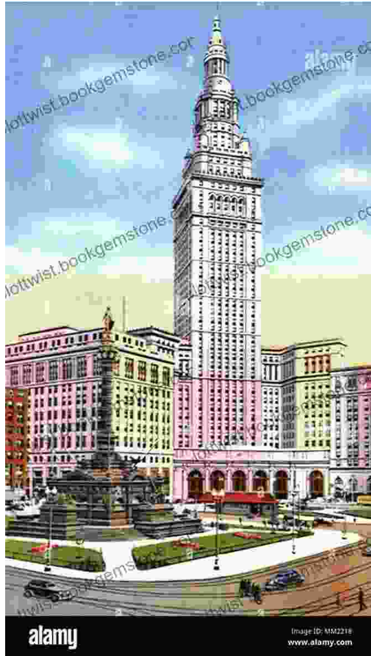
Terminal Tower, Cleveland