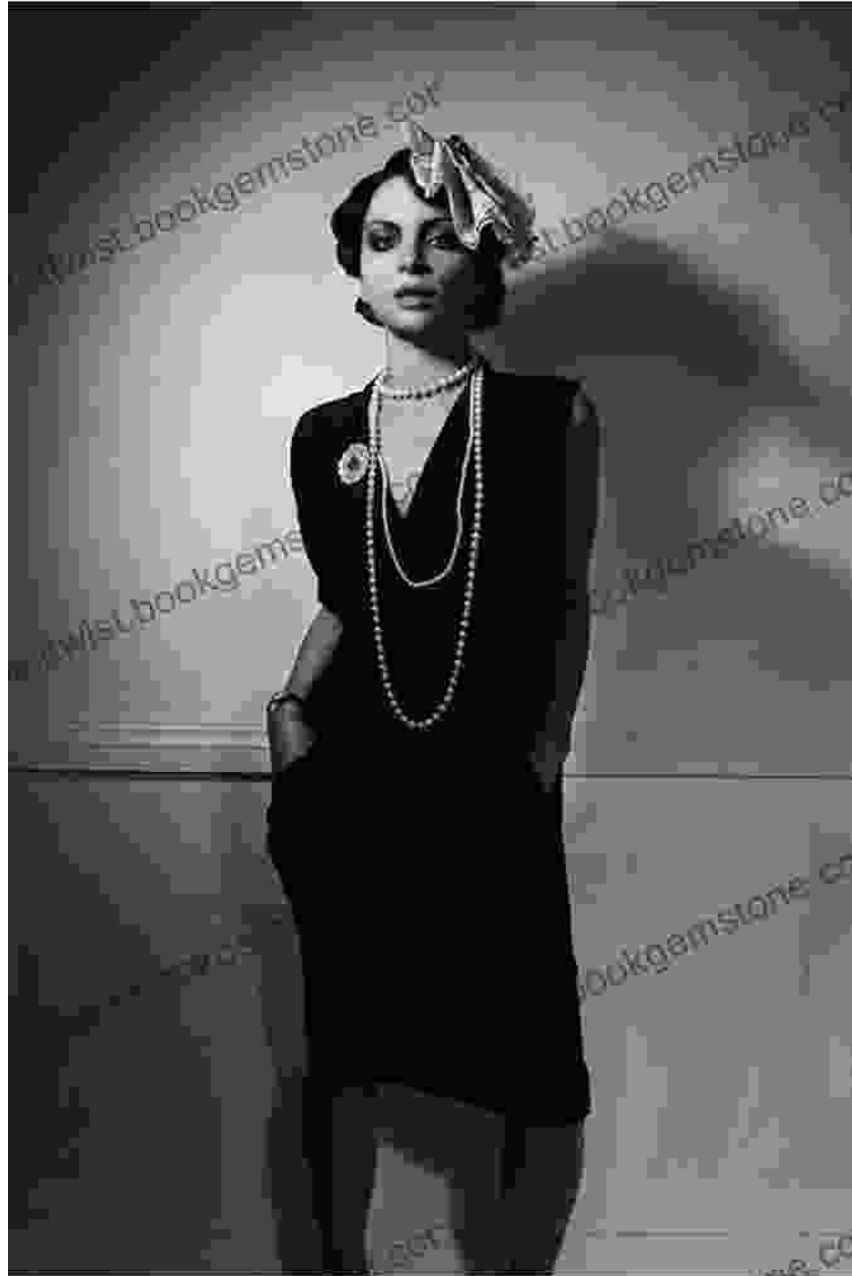
The little black dress, an iconic creation by Coco Chanel.