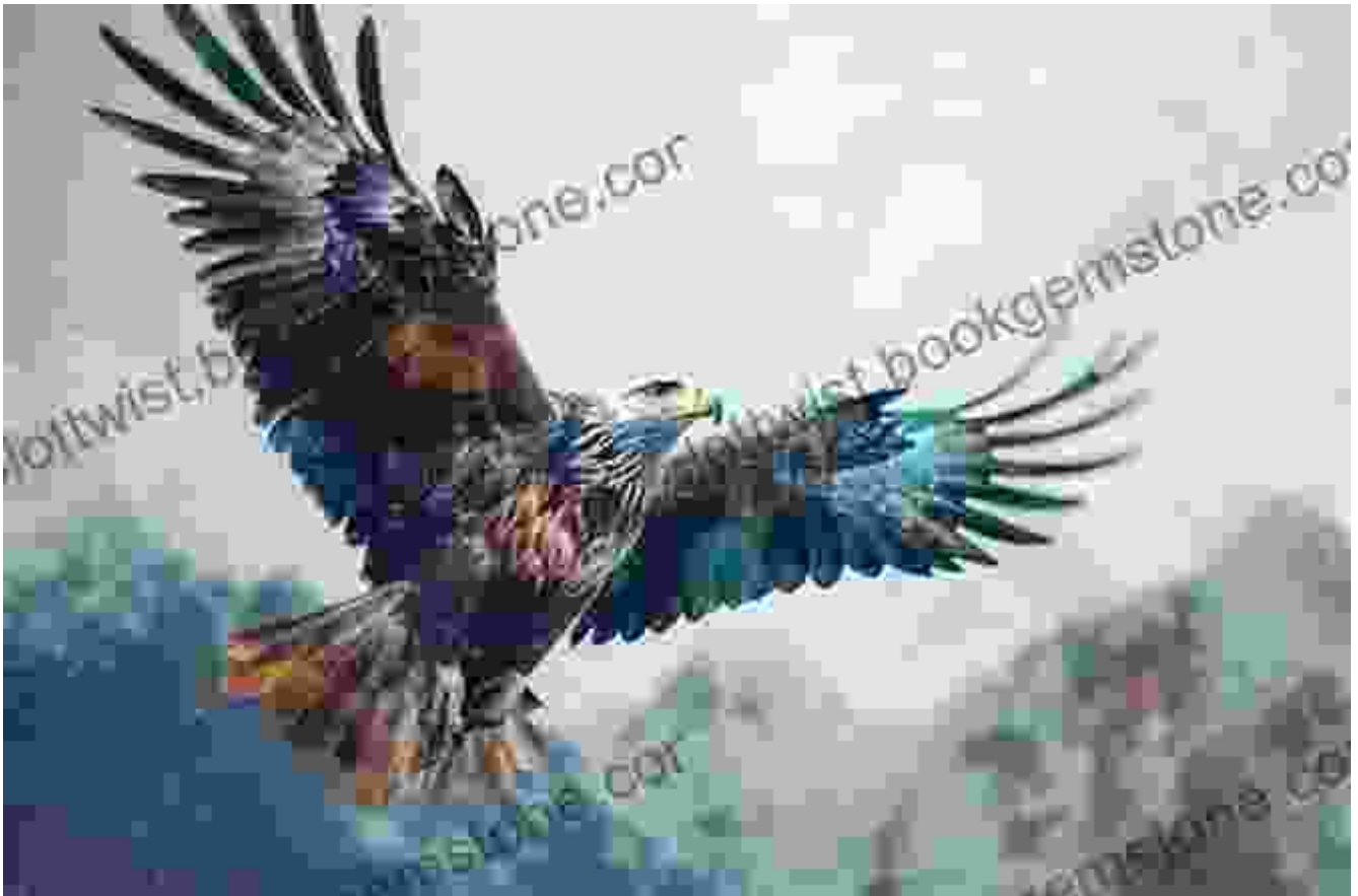
Eagle , by Volodymyr Orlovsky

paintings are characterized by their vibrant colors, realistic textures, and a deep understanding of animal anatomy.