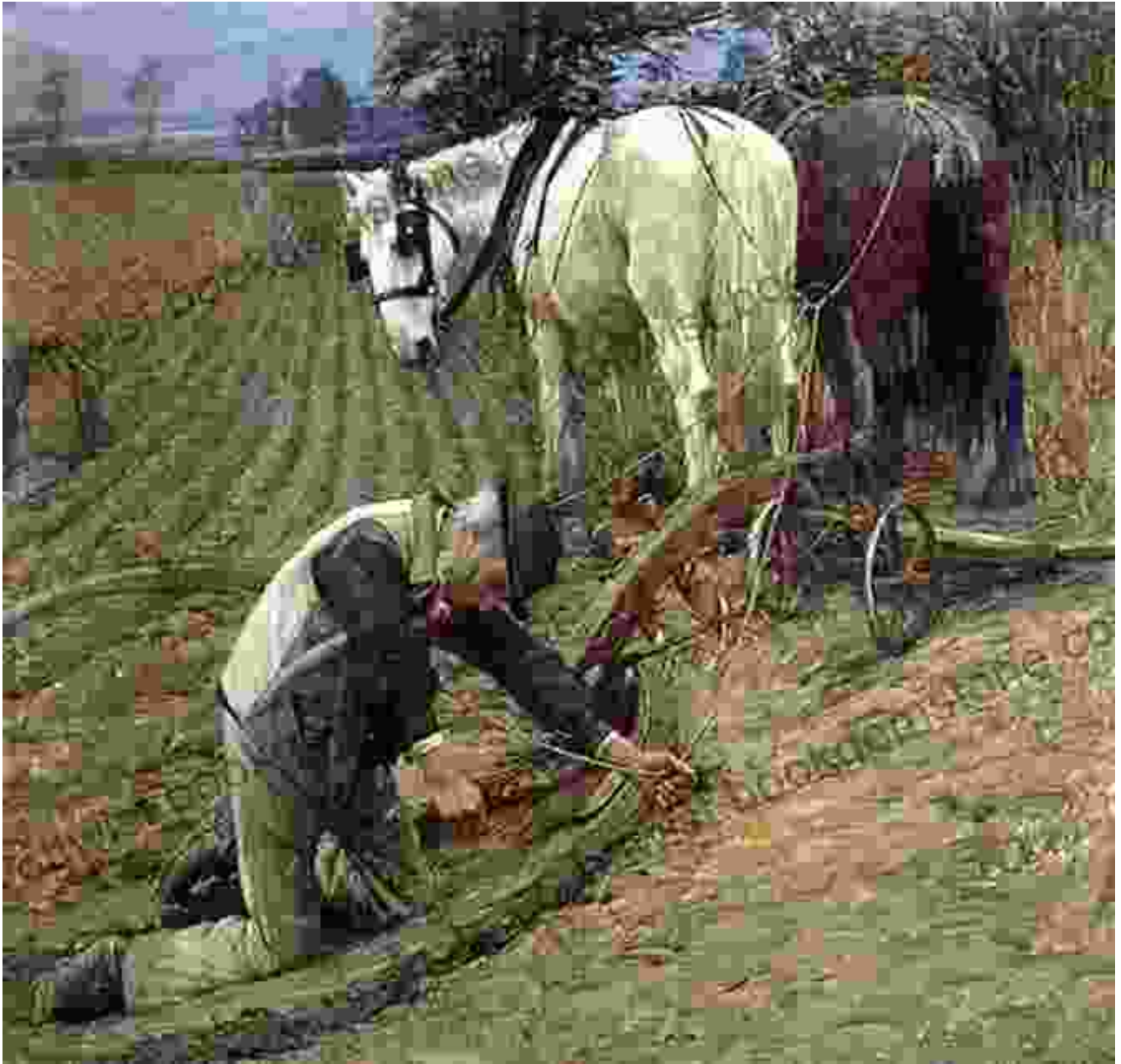
The Potato Gatherers